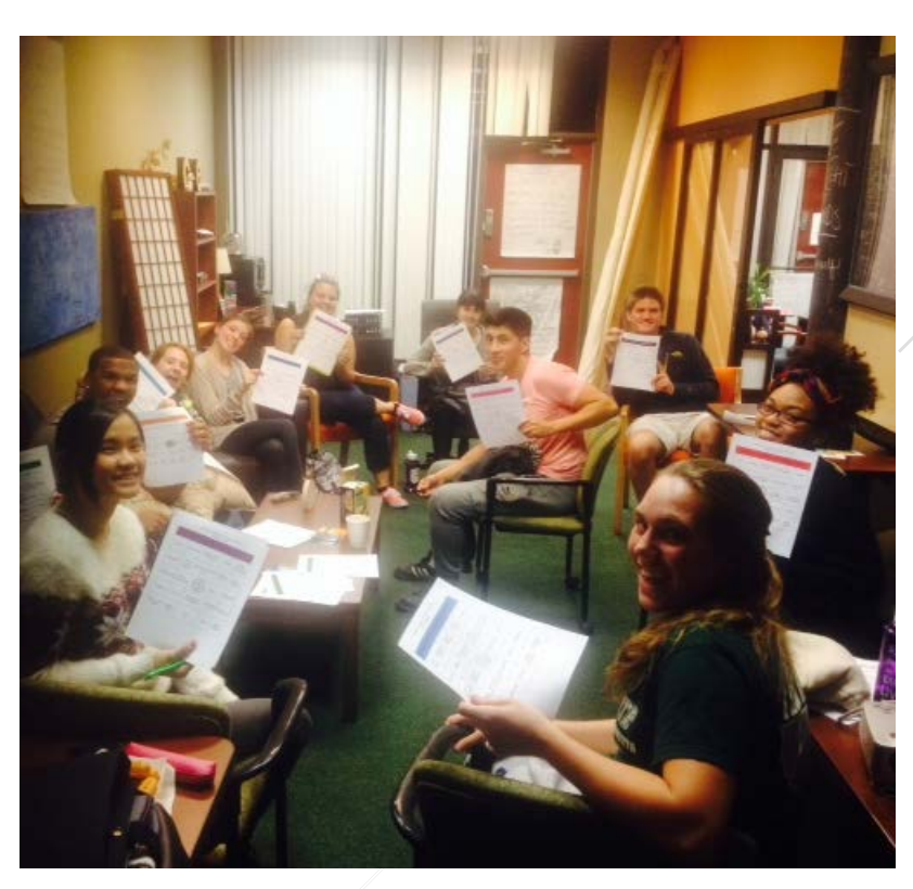
Students enjoying a game of SCSV Bingo at Wagner College.

There are several ways you can give back. For example, make a difference off-campus and visit local neighborhoods and register people to vote. Contribute to the community in some other way by committing to a group service project (i.e. volunteering at a local non-profit organization that provides day-care for parents who want to vote).